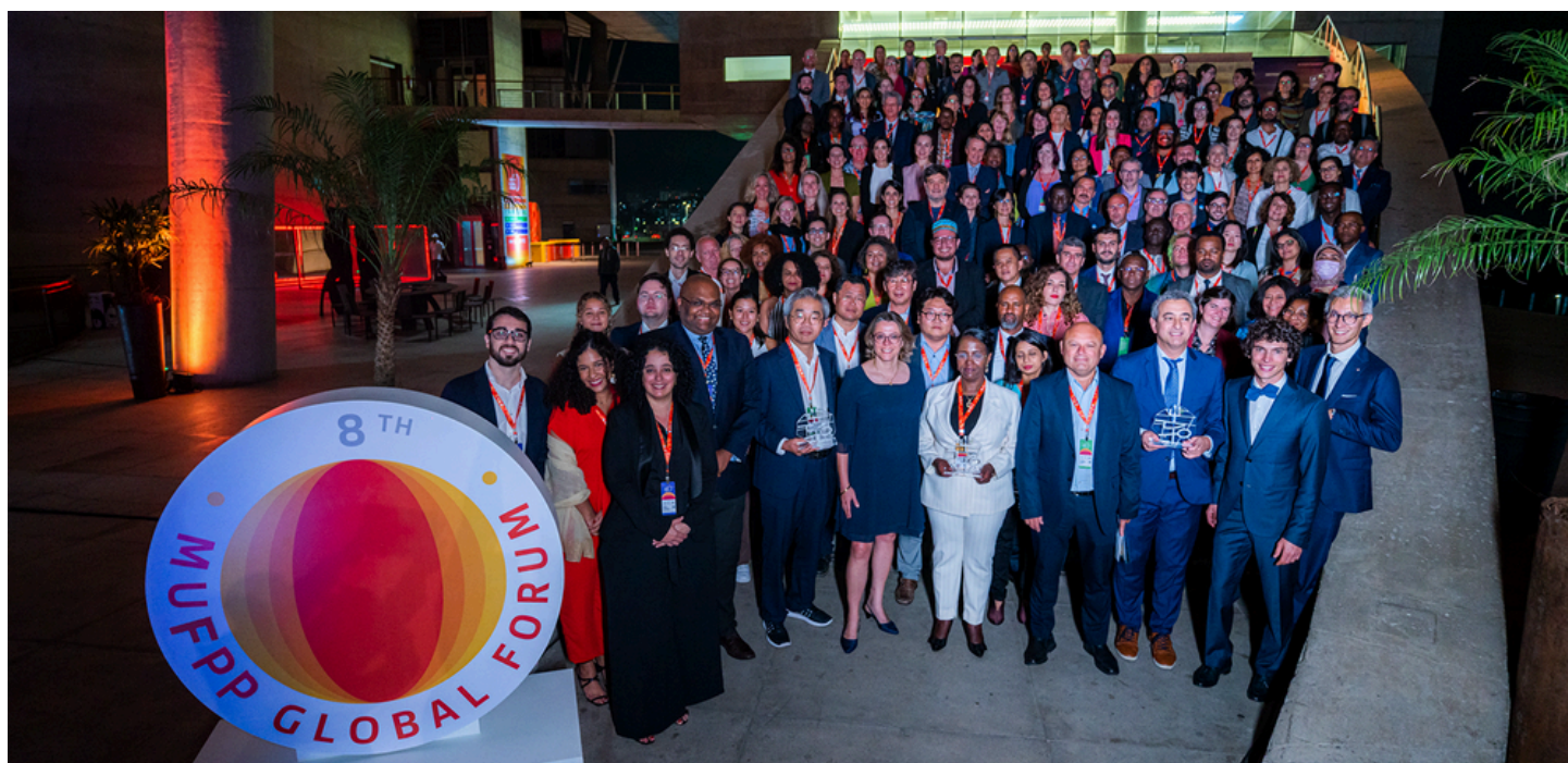
Last MUFPP Global Forum hosted in Rio De Janeiro (2022)

Throughout the day, MUFPP signatory cities and strategic partners will be encouraged to launch new training initiatives, mentorship programmes, and technical cooperation, building the foundation for the MUFPP future dedicated to local policymakers and city officers , designed to ensure continuity, quality, and ambition in the local implementation of food policies.